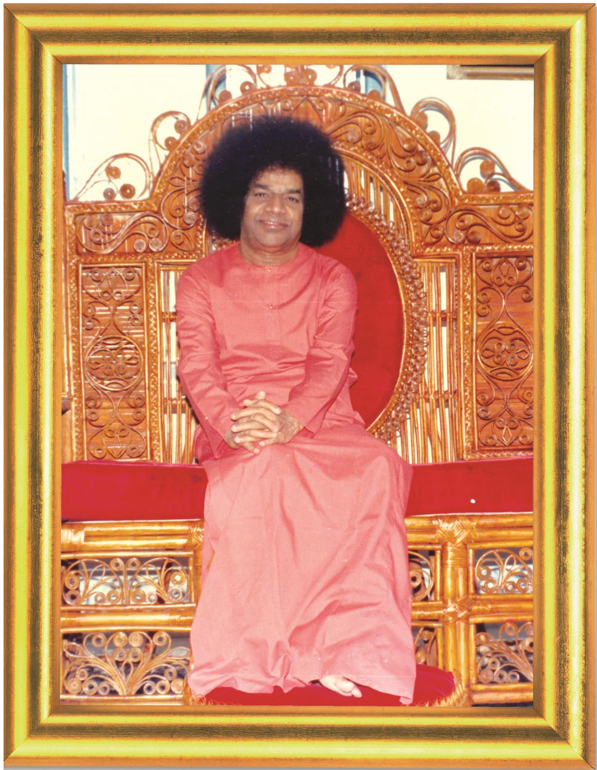
Chancellors Room Sri Sathya Sai Institute of Higher Learning Administration Block