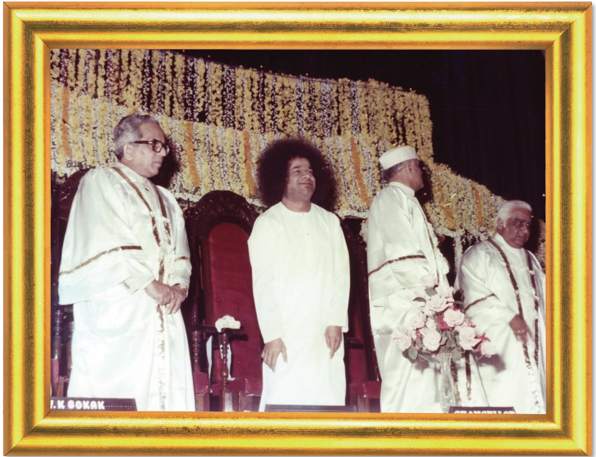
First Convocation of Sri Sathya Sai Institute of Higher Learning 22 nd November 1982