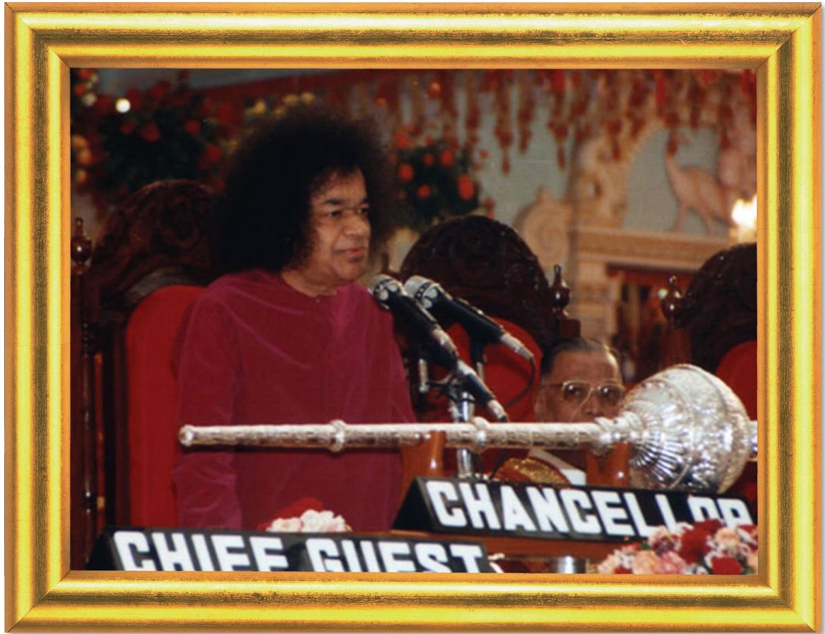
Convocation Address by Founder Chancellor Bhagawan Sri Sathya Sai Baba